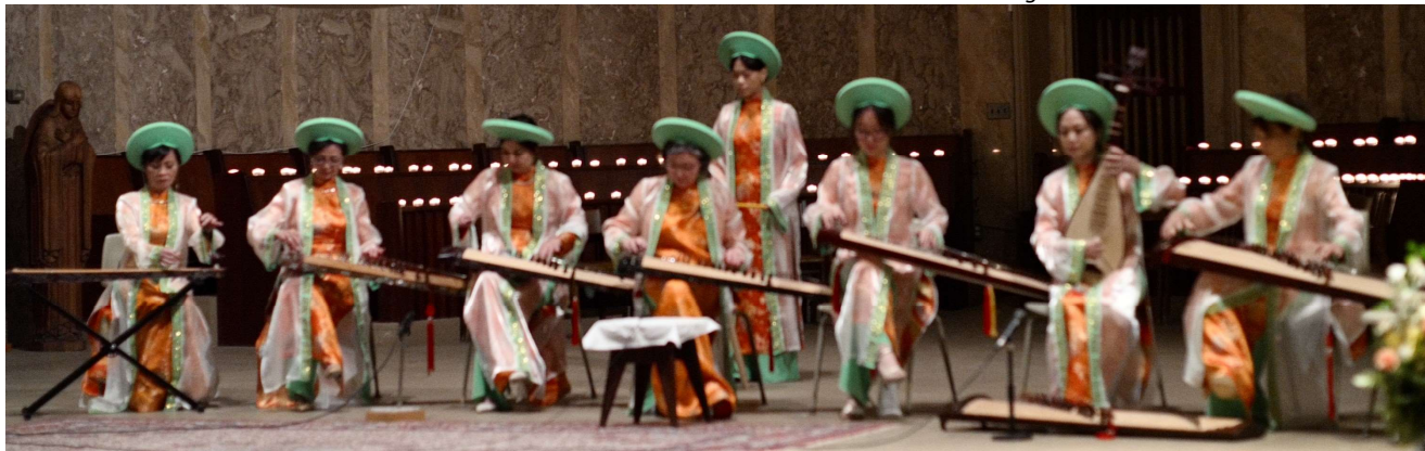
Phương Ca, Montréal et Tre Việt, Toronto

Vietnamese Cultural Weeks 2023 are presented